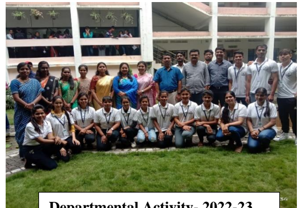
Departmental Activity- 2022-23