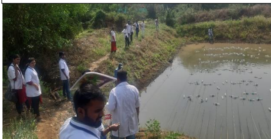
Visit to Pearl Oyster Farm 2019-20