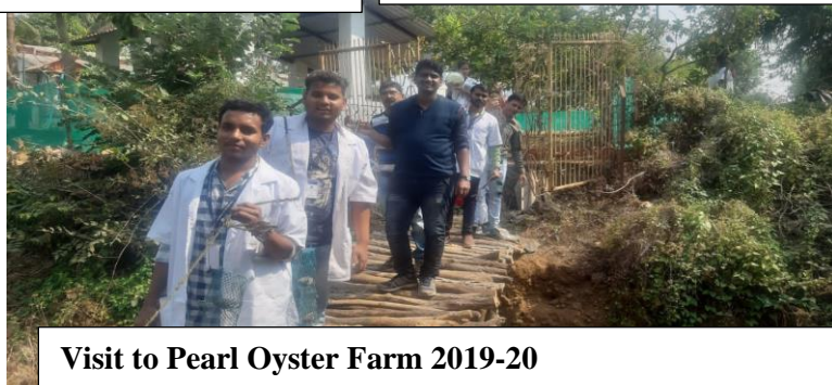
Visit to Pearl Oyster Farm 2019-20