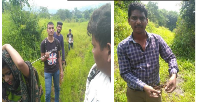
Extension Activity during Biodiversity Survey (2018-19)