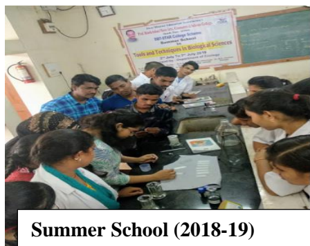
Summer School (2018-19)