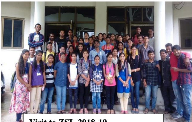
Visit to ZSI- 2018-19