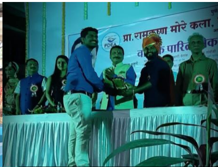
Received Award during Annual Prize Distribution to Qualifying NET, SET and GATE Exam