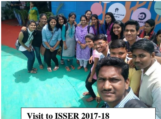
Visit to ISSER 2017-18