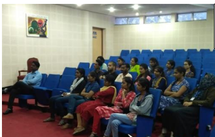
Visit to NARI 2017-18