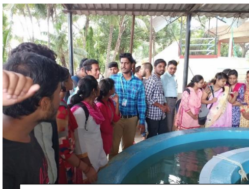
Visit to Govt. Fish Farm Hadapsar 2017-18