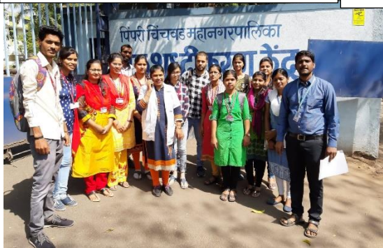
Visit to Pearl Oyster Farm 2019-20