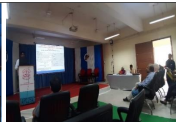
Paper Presented in International Conference at Kerala 2020