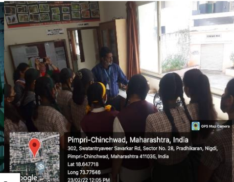
Delivering Lecture to School Students on Science Day 2021-22